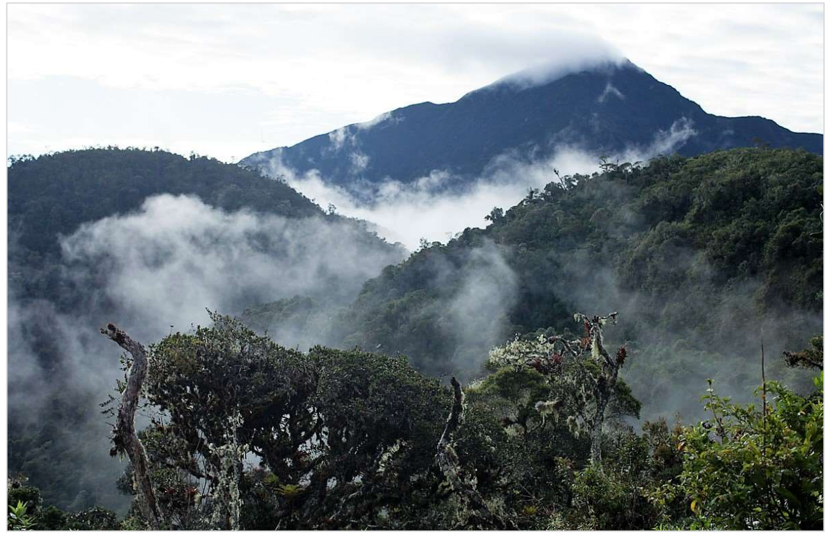
Abra Patricia Alto Mayo Cloud Forest, Amazon Highland

Highlights • Tarapoto • Urku Wildlife Center • Bird Watching • Chazuta • Huallaga River Tour • Pongo Amazonas • Urku Wildlife Refuge • Moyobamba • Tingana Nature Reserve • Alto Mayo Cloud Forest • Abra Patricia Owl Sanctuary • Gocta Falls • Kuelap Fortress • Jaen.