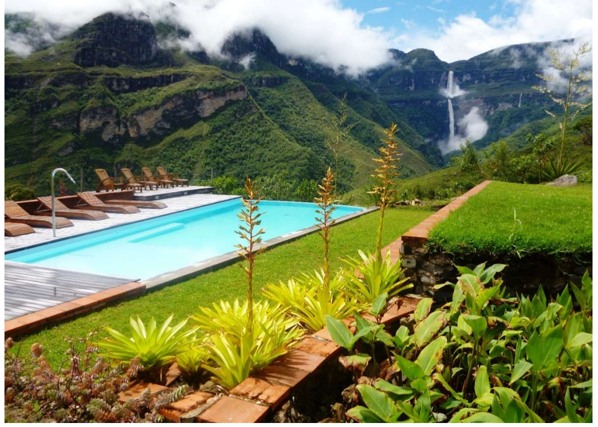
Gocta Falls view from the Gocta Lodge, Amazon Highland

Highlights • Tarapoto • Urku Wildlife Center • Bird Watching • Chazuta • Huallaga River Tour • Pongo Amazonas • Urku Wildlife Refuge • Moyobamba • Tingana Nature Reserve • Alto Mayo Cloud Forest • Abra Patricia Owl Sanctuary • Gocta Falls • Kuelap Fortress • Jaen.