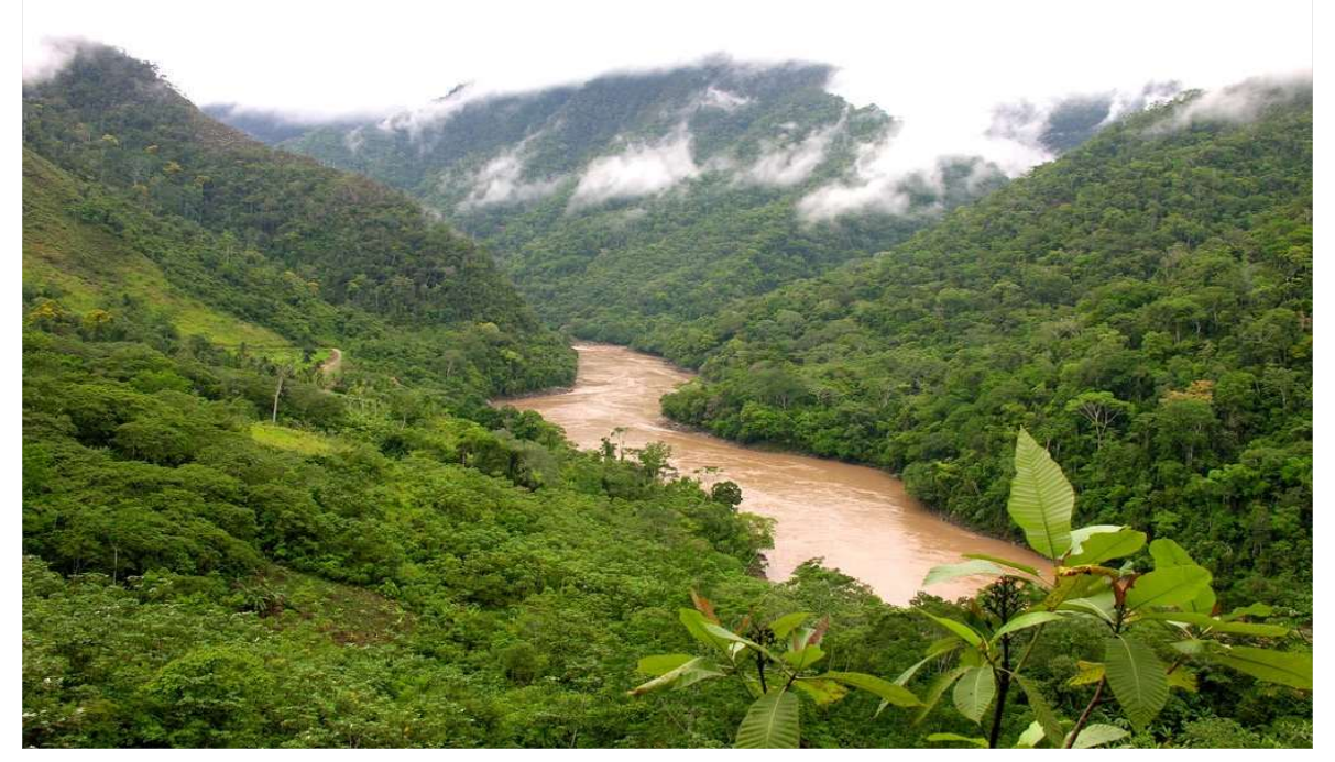
Huallaga River Amazonia

Highlights • Tarapoto • Urku Wildlife Center • Bird Watching • Chazuta • Huallaga River Tour • Pongo Amazonas • Urku Wildlife Refuge • Moyobamba • Tingana Nature Reserve • Alto Mayo Cloud Forest • Abra Patricia Owl Sanctuary • Gocta Falls • Kuelap Fortress • Jaen.