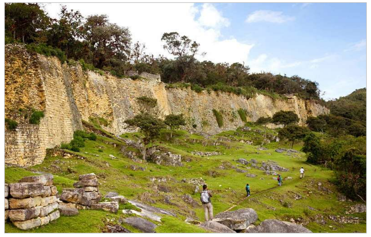
Kuelap Fortress 3,000 meters, Chachapoyas

Highlights • Tarapoto • Urku Wildlife Center • Bird Watching • Chazuta • Huallaga River Tour • Pongo Amazonas • Urku Wildlife Refuge • Moyobamba • Tingana Nature Reserve • Alto Mayo Cloud Forest • Abra Patricia Owl Sanctuary • Gocta Falls • Kuelap Fortress • Jaen.